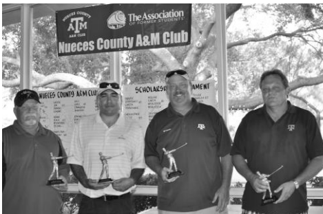
2 nd Place Team – CCAD