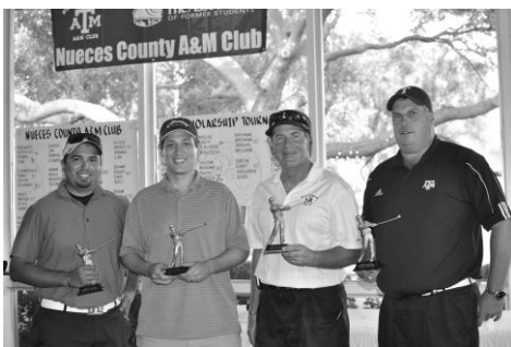
1 st Place Team – BBVA Compass