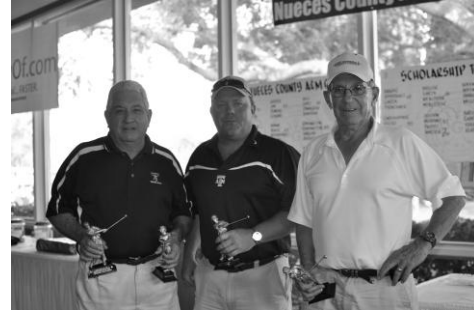
3 rd Place Team – LNV Engineering